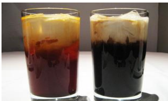
THAI ICED TEA

Items marked with a 🌶️ indicate hot and spicy (Gluten Free– Add $2.00)