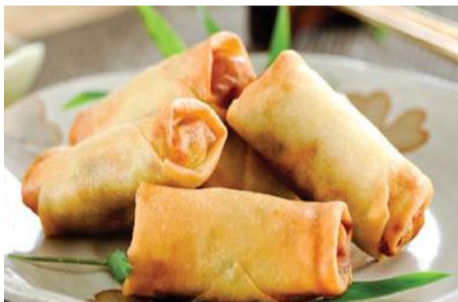
MINI VEG EGG ROLLS