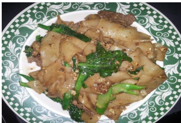
PAD SEE EIW