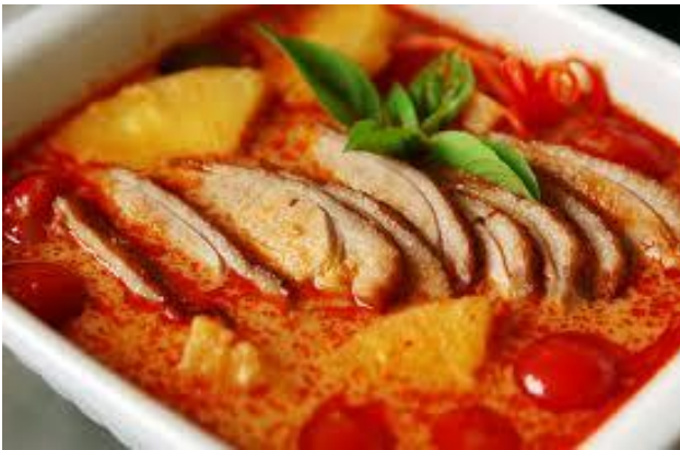
ROAST DUCK CURRY