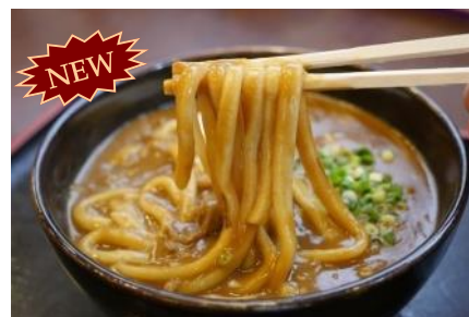
Thai Curry Udon Soup