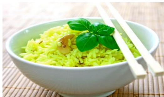
NEW YELLOW CURRY FRIED RICE ( 18.99 ) ( Stir fried with onions, cashews, and choice of meat)